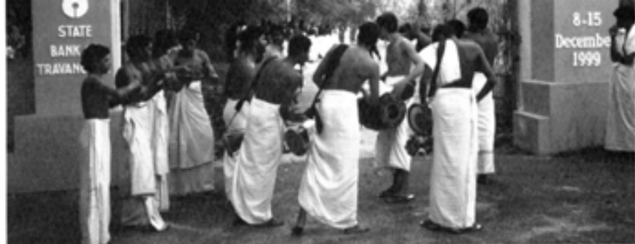
Global Alliance for Justice Education conference welcoming party, conference opening

and to address the practical as well as theoretical issues of how a justice dimension to legal education can be achieved.