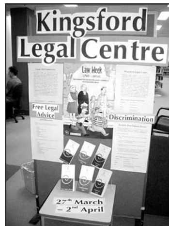
Law week display

2 % of our clients identified themselves as Aboriginal or Torres Strait Islander