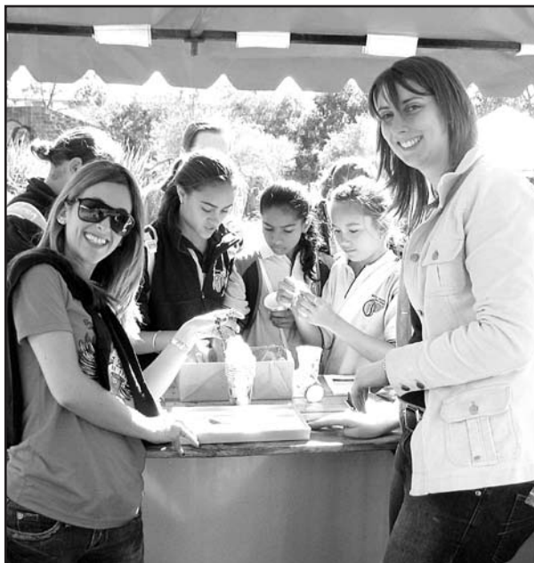
KLC students celebrating Women's Day at Kooloora Community Centre