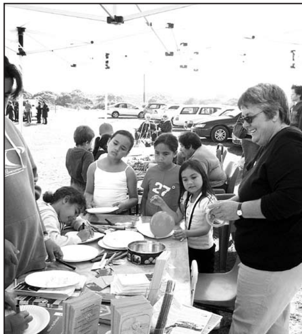
KLC stall at NAIDOC celebrations