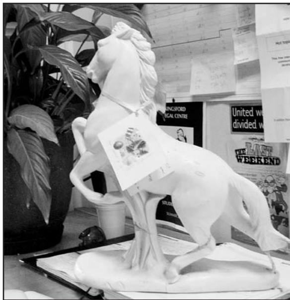
KLC's Lucky Horse