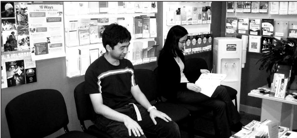
KLC waiting room

In another notable success, the clinic settled five matters against the one employer who had 'retrenched' an entire workforce then selectively re-employed only some of the employees. The matters all resulted in compensation for our clients following conciliation in the Australian Industrial Relations Commission. There were also successful outcomes for unfair dismissal matters in the NSW Industrial Relations Commission and recovery of entitlements in the Chief Industrial Magistrates Court.