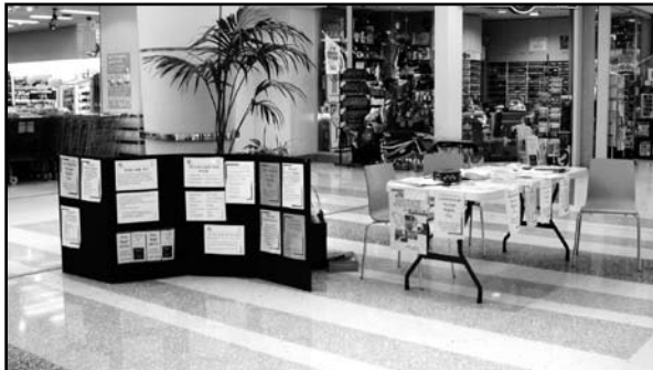
Information stall at South Point Shopping Centre

The Centre would like to thank the representatives from the following community organisations who participated in the KLC Consultative Committee during 2008: The Deli Women and Children's Centre, the Junction Neighbourhood Centre, Randwick City Council, Eastern Area Tenants Service and South East Neighbourhood Centre. The consultative committee provides KLC with the opportunity to discuss the services provided by the Centre, issues facing our community and clients and to assist with the planning for new projects.