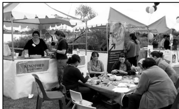
NAIDOC celebration at Yarra Bay