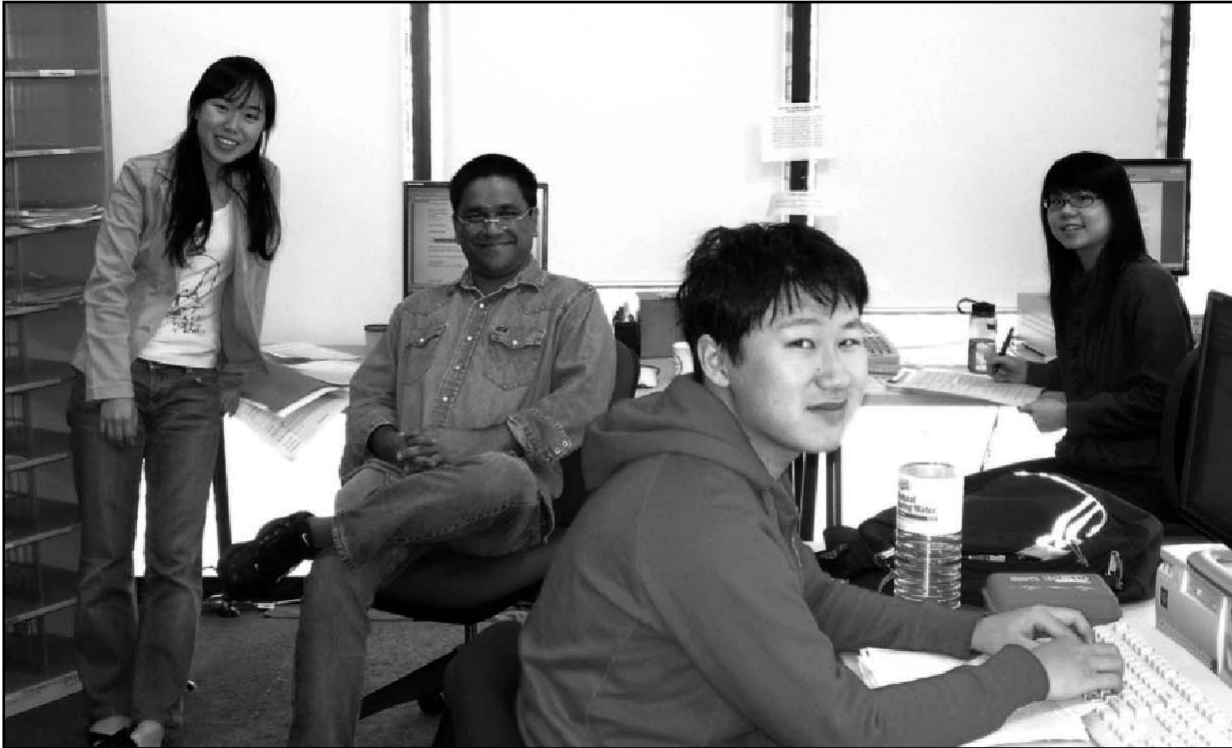
KLC students hard at work

International Covenant on Civil and Political Rights (ICCPR) to the UN Human Rights Committee (HRC). The ICCPR Report was contributed to by over 50 NGOs and supported by over 200. Our ICESCR and ICCPR Reports, which are known together as Freedom, Respect, Equality, Dignity: Action are a comprehensive analysis of human rights in Australia and include a range of targeted recommendations to address disadvantage. The CESCR and HRC will review Australia's implementation of ICESCR and ICCPR next year.