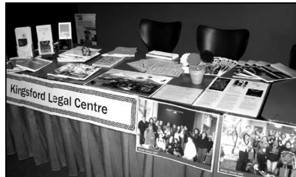
KLC display at the UNSW Indigenous Showcase

In partnership with The Deli Women and Children's Centre, KLC participated in the NAIDOC celebrations held at La Perouse. In addition to the information stall, activities such as making stress balls and necklaces were provided for the children.