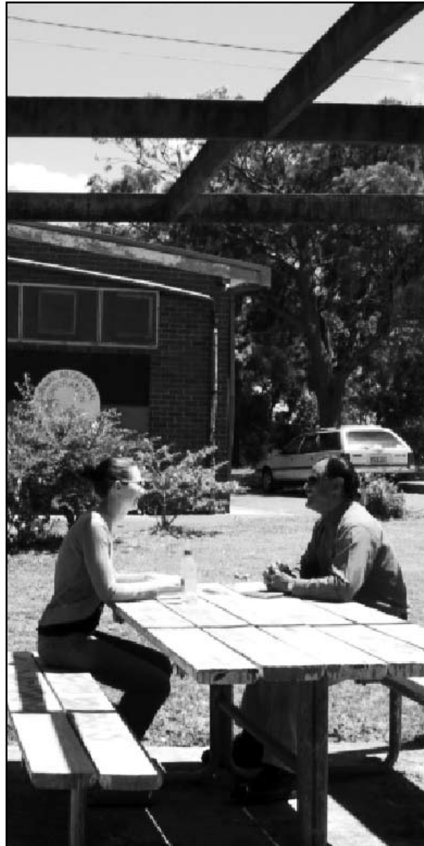
Providing legal advice at Yarra House

The drop-in service at Yarra Bay House, La Perouse was continued throughout 2008. This service is one of the strategies that we have implemented to increase and improve the access to KLC by the local Aboriginal community. We would like to thank Guriwal Aboriginal Corporation and the La Perouse Local Aboriginal Land Council for their assistance in providing the venue and promoting this service.