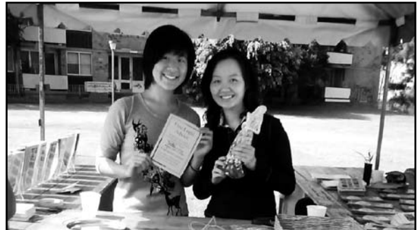
KLC stall at Kooloora Women's Day event

Kingsford Legal Centre participated in several community events including the 2008 Yabun Festival, Women's Day celebration at Kooloora Community Centre, open day at the Junction Neighbourhood Centre and the UNSW Indigenous Showcase.