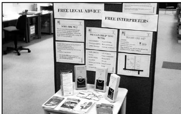
Display at Randwick City Library