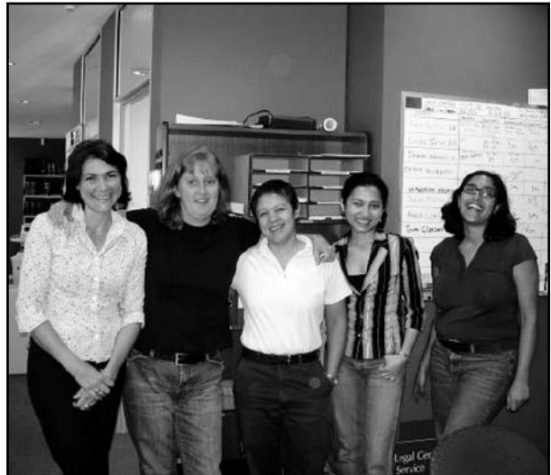
Cheerful workers at KLC