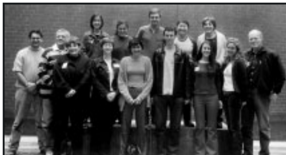
GAJE Conference Steering Committee

Australian citizens and the rest of the region. The conference was a unique opportunity to attend a forum where these crucial issues were discussed from a legal and social perspective.