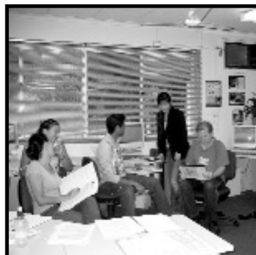
Image credits, above then clockwise - all credits from left to right: