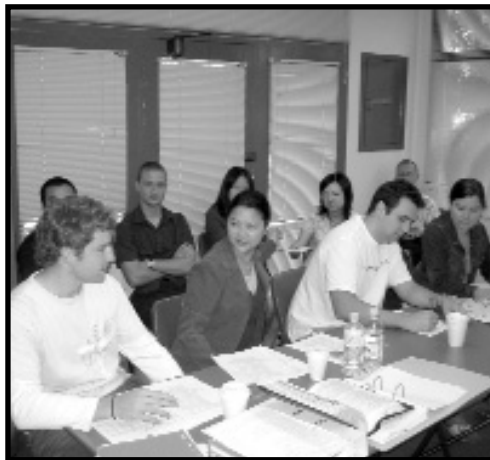
Semester 2 - Mock Conciliation

advice to clients on employment law issues such as unfair dismissals, unpaid wages, workplace harassment and redundancy. The Clinic also provides ongoing assistance and representation where appropriate, with frequent appearances for clients in the State and Federal Industrial Relations Commissions.