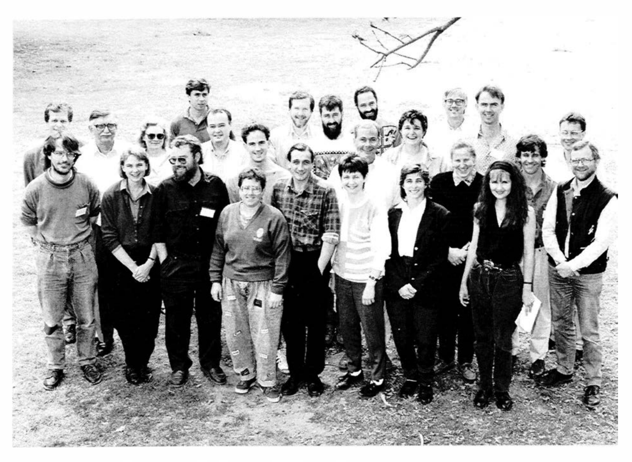
Participants in the 1992 National Conference on Clinical Legal Education hosted by the Centre

Twice in recent years Springvale Legal Service has organised meetings of people interested or participating in clinical legal education. To mark the Centre's tenth anniversary, and to pick up on the current interest in clinical legal education, we decided to organise a full scale conference, the first of its kind in Australia. There was considerable interest in the conference, resulting in participants from around the country, and in the presentation of a number of excellent papers.