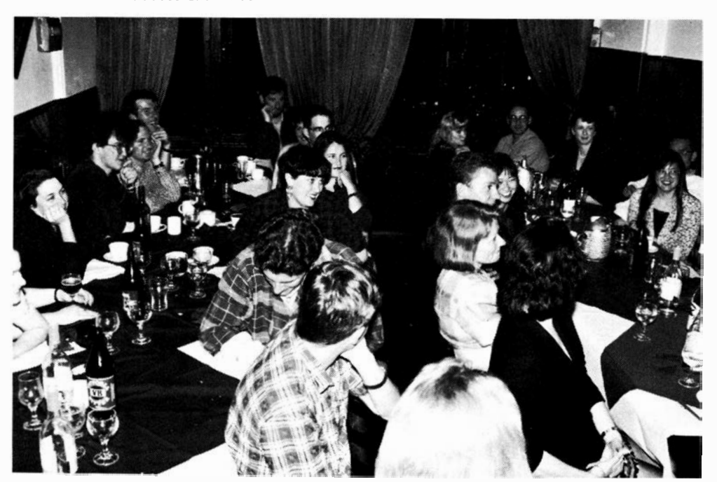
6. Farewell dinner for student law clerks