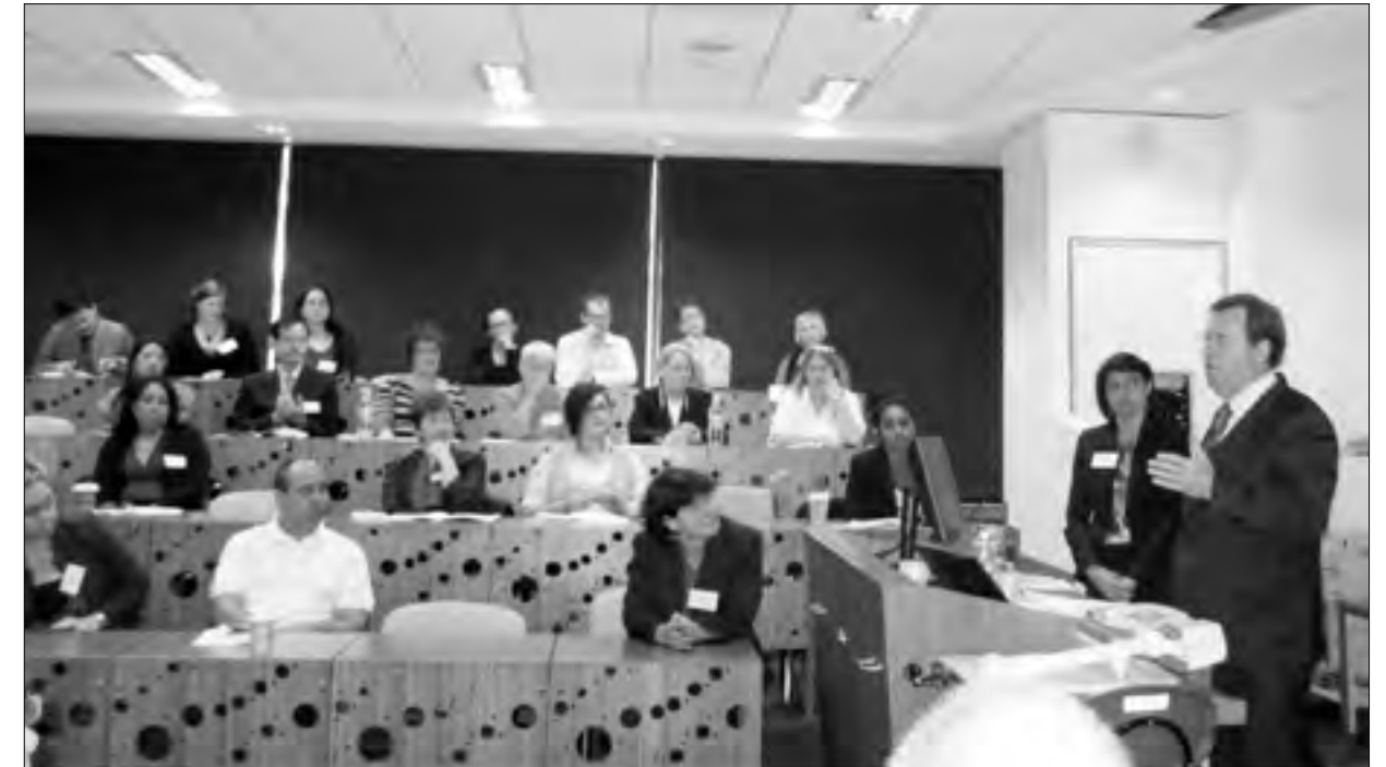
Attorney General The Hon Robert McLelland opening the National Clinical Conference