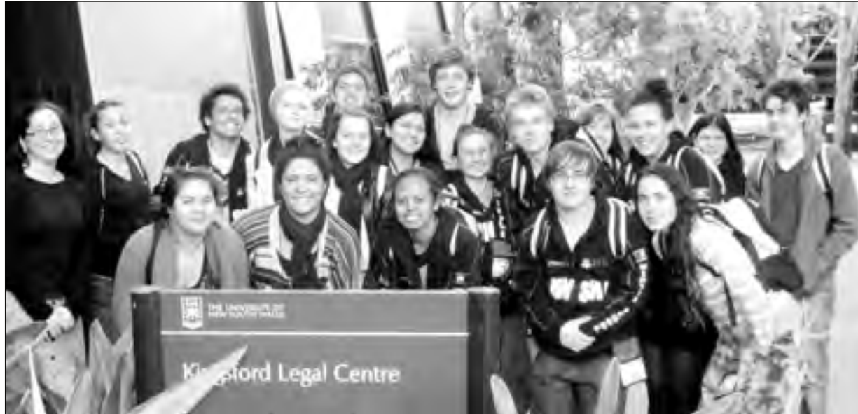
Winter School Students 2011