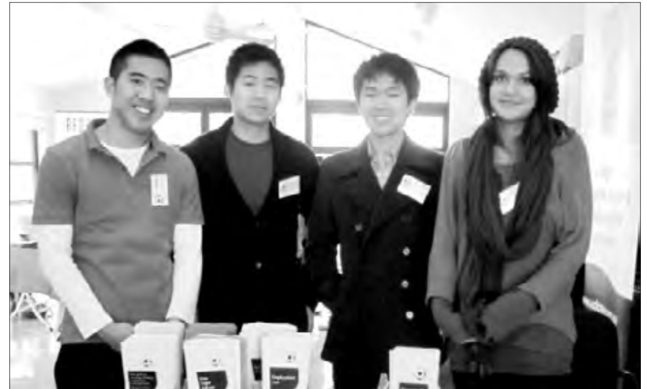
KLC students at Legal Expo and CLE