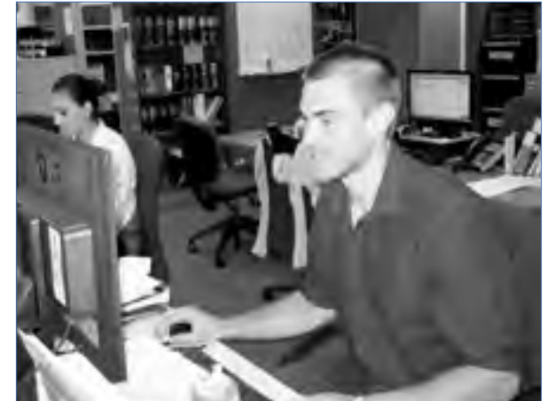
Clinical students at the Centre

In 2011 we ran for the ninth time the Foundations Enrichment course for first year Indigenous students. The program is designed to assist first year Indigenous students to acclimatise to university studies and develop graduate attributes of oral and written communication skills in a legal setting. Through engaging law students in the day to day operation of the legal system and lawyering, the clinical placement bridges the gap between the theory and practice of the law. Students are given the opportunity to assist people in our community while simultaneously acquiring valuable communication skills.