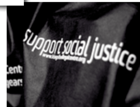
KLC – supporting social justice for 30 years