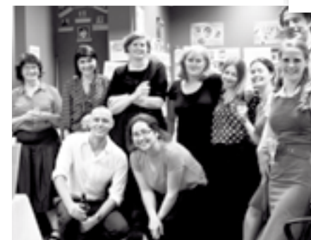
KLC Staff, Secondees and Friends (past and present)