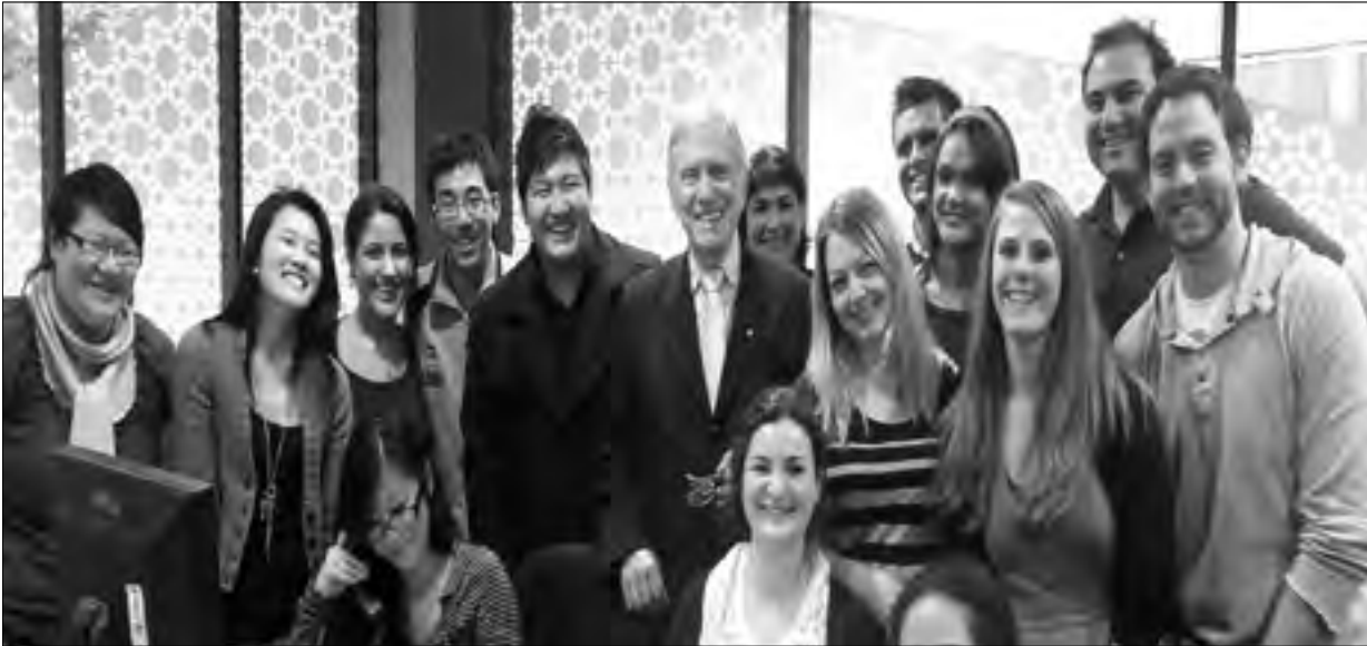
KLC students enjoy a visit by Justice Michael Kirby