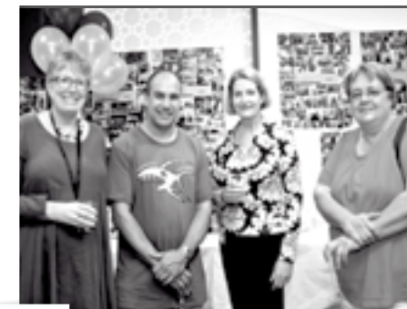
KLC staff and friends