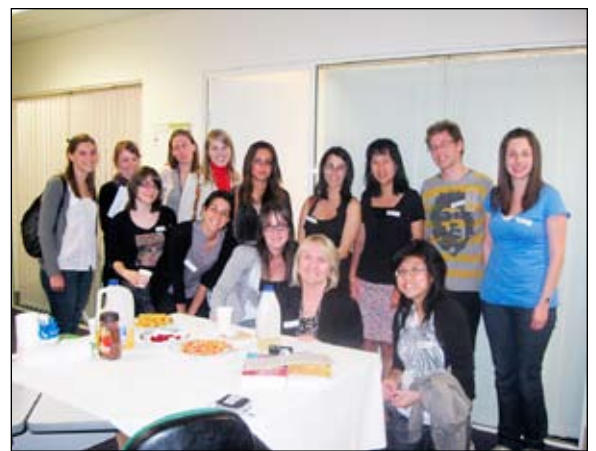
KLC students at Prince of Wales Hospital

Students from the Kingsford Legal Centre and the Prince of Wales Hospital Social Work Department spent a day in each others' shoes once again following a successful partnership in 2008. Three social work students from Prince of Wales Hospital and 2 from the UNSW CD Project visited KLC to gain a better understanding of how law and social work often interact with each other. Staff and students from KLC spoke about the different aspects of law that we often deal with, as well as how to make quick and better referrals for clients to ensure they receive the appropriate services. On 29 September, ten KLC students spent a day in the life of a social worker at the Prince of Wales Hospital Social Work Department. Students were given an insightful tour of the hospital and the coordinators and team leaders spoke about the work involved in each of the four areas of work including aged care, acute care, spinal and oncology. All students who participated in the exchange had extremely positive feedback, noting that the experience provided them with a great insight into the role of social workers and lawyers and how they often need to collaborate to provide a more holistic approach to all their clients.