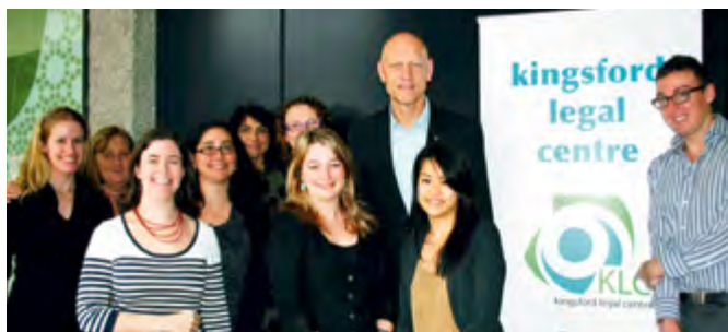
MP Peter Garrett and KLC staff at the launch of the refurbished KLC

KLC has been renovated to improve the flow between our students, staff and clients. The renovations began in March and took around 6 weeks to complete. We welcomed MP Peter Garrett and a host of community workers, volunteer solicitors and UNSW colleagues to help us launch the new centre in May.