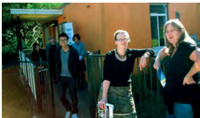
KLC Students and Staff at the South Coogee Housing Estate Pop-up Clinic in May

KLC has been concerned that residents on some of the DOH housing estates within our catchment area may have difficulties accessing the Centre by public transport, so we are organising a number of pop-up clinics where secondees are available to give face to face legal advice, and students are on hand to help out and promote the centre. We have held one clinic at South Coogee housing estate and have another took place in August at Duffy's Corner, Maroubra.