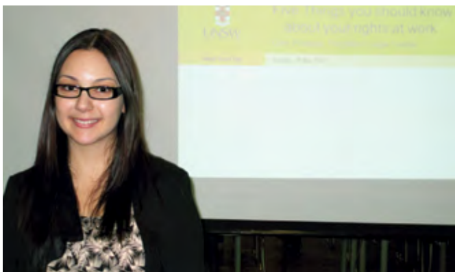
KLC Student at the Eastern Suburbs Migrant Refugee Employment Expo

you should know about your rights at work', was aimed at newly arrived migrants starting out in the workforce. The talk was well received with many of the attendees keen to find out more about KLC's employment advice clinic and the basics of working in Australia.